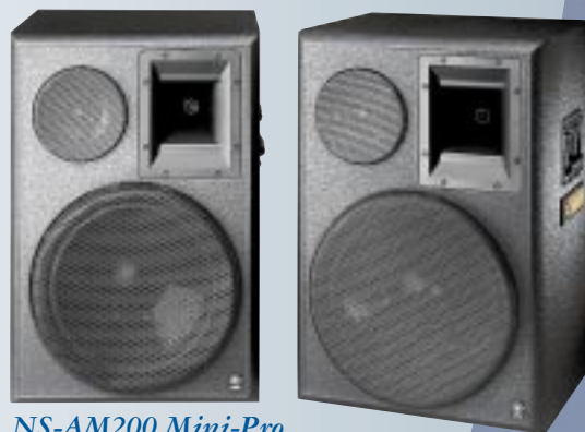
NS-AM200 Mini-Pro 12" woofer, 5 1/4" midrange with 4x4 tweeter

Oversized gold-colored, embossed Yamaha logos emphasize the performance strength of these power-hungry, uniquely designed speaker systems.