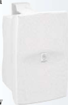
NS-AW2W 6-1/2" woofer with 1-1/2" tweeter

For easy mounting, the speakers come with swivel mounting brackets. The NS-AW1 and 1W come in black or white micro-pebble finish, while the larger NS-AW2W is only available in white finish.