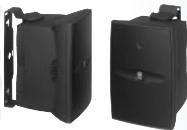
NS-AW1 and NS-AW1W 5" woofer with 1/2" tweeter