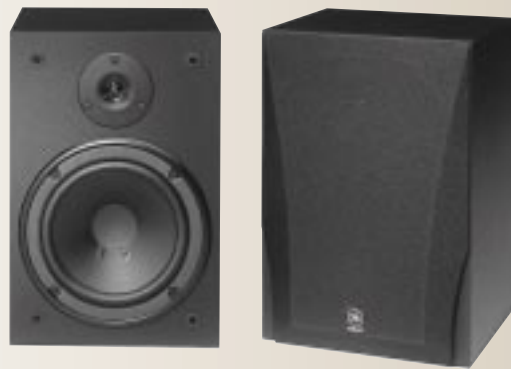
NS-A528 6" woofer with 3/4" tweeter