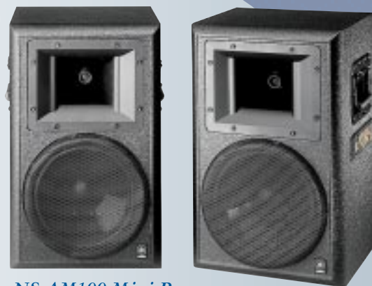
NS-AM100 Mini-Pro 8" woofer with 4x4 tweeter