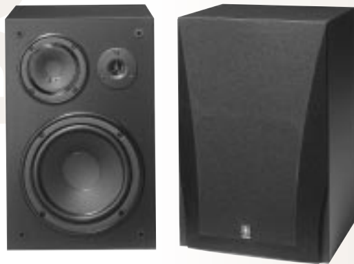
NS-A638 8" woofer, 4" midrange with 3/4" tweeter

Each system is magnetically shielded for use near your TV without degrading the picture via the stray magnetic field that all speakers generate. Convenient placement is further ensured by their compact, high-performance design. Put them anywhere and they'll bring down the house with their exciting performance.