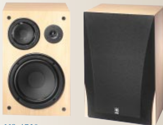
NS-A738 (birch finish) 8" woofer, 4" midrange with 3/4" tweeter